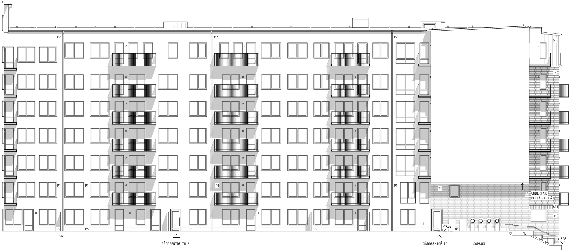
GÅRDSFASAD MOT VÄST