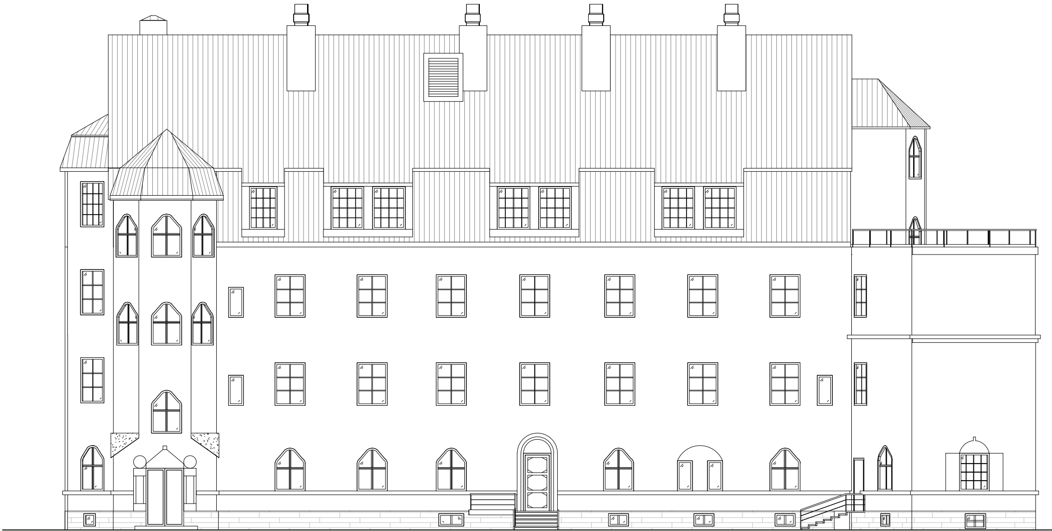
1 FASAD MOT NORDOST 1 : 150