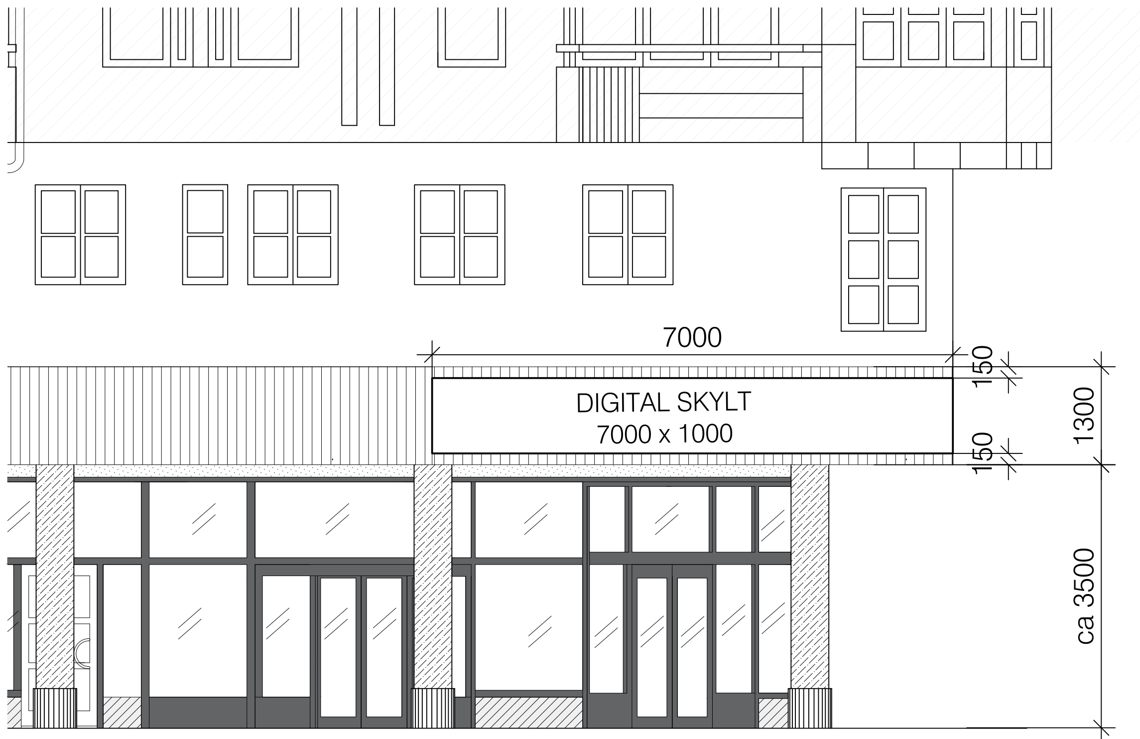
METER 0 1 2 5 A1-FORMAT (1:50) A3-FORMAT (1:100)